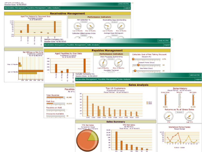
Accounts Payable, receivable and Sales Analysis dashboards