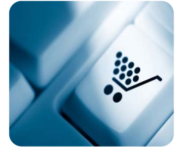
Web Development & eCommerce